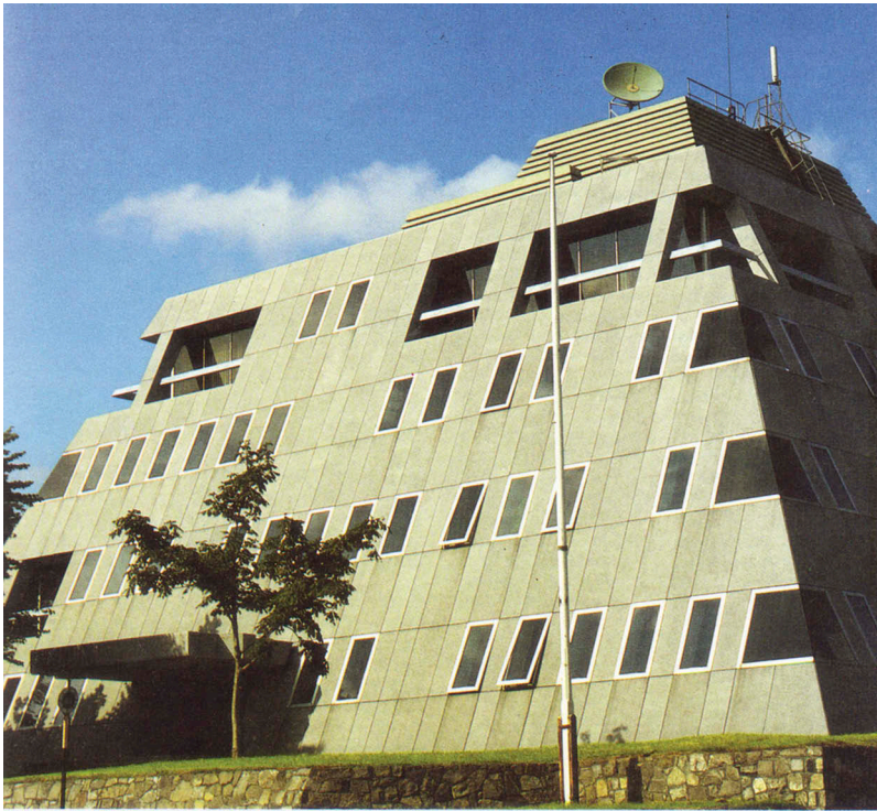
Figure 1. The Irish Meteorological Service headquarters in Glasnevin, Dublin. This image was taken shortly after the Service moved to its new home in 1979.