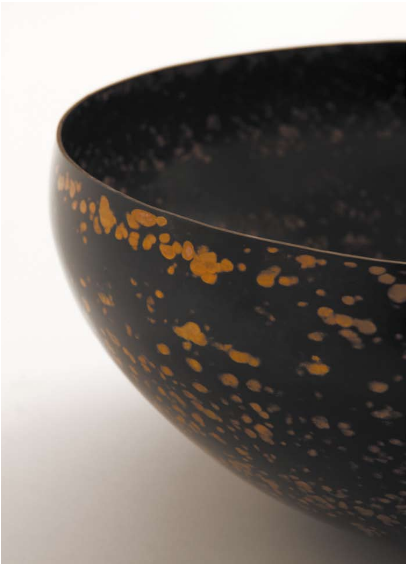
'Shakudo bowl' (gold/copper alloy) by metalsmith Cólín Ó'Dubhghail.