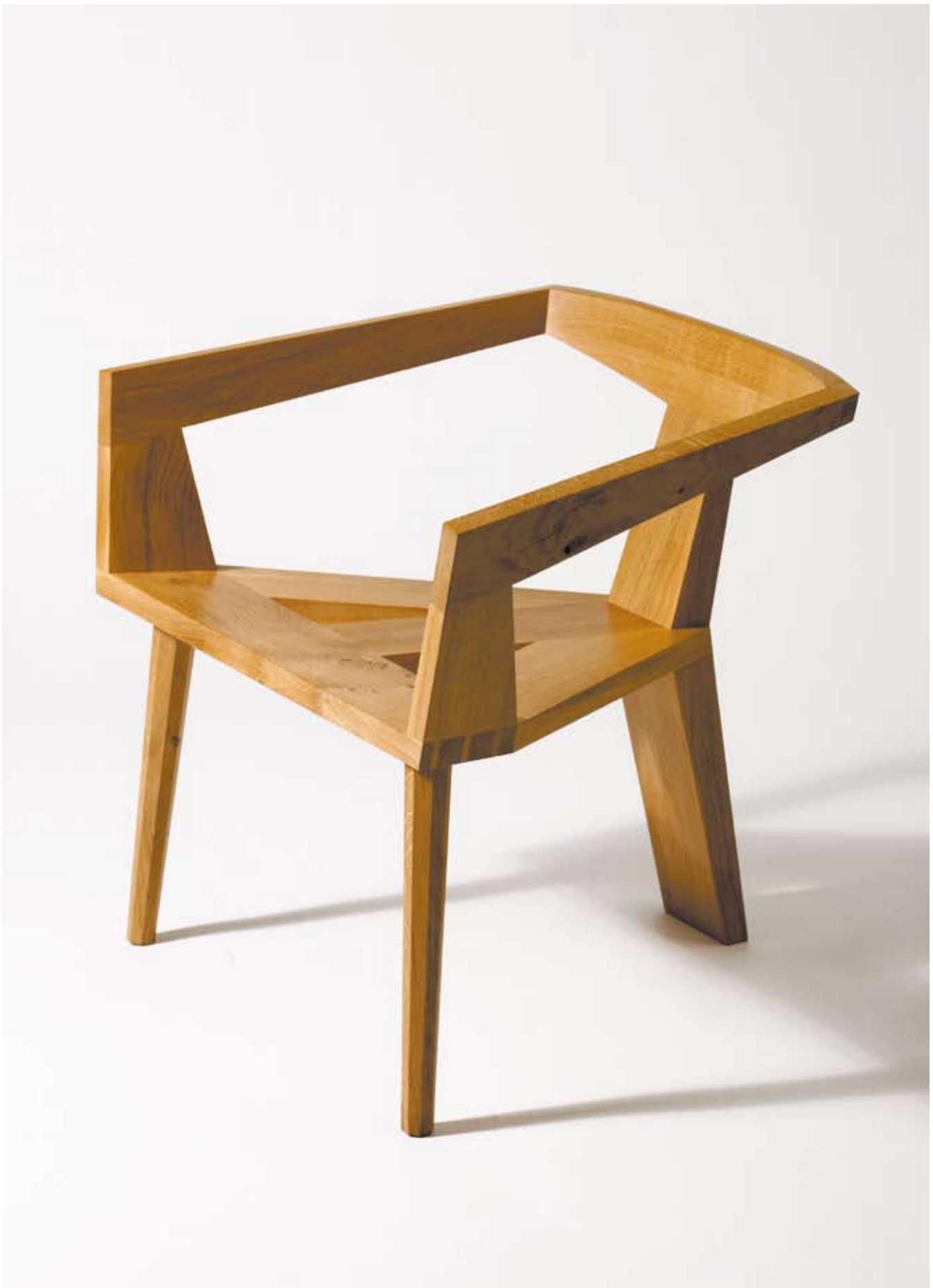
'Sligo 1' Irish oak chair by furniture makers Yaffe Mays Furniture.