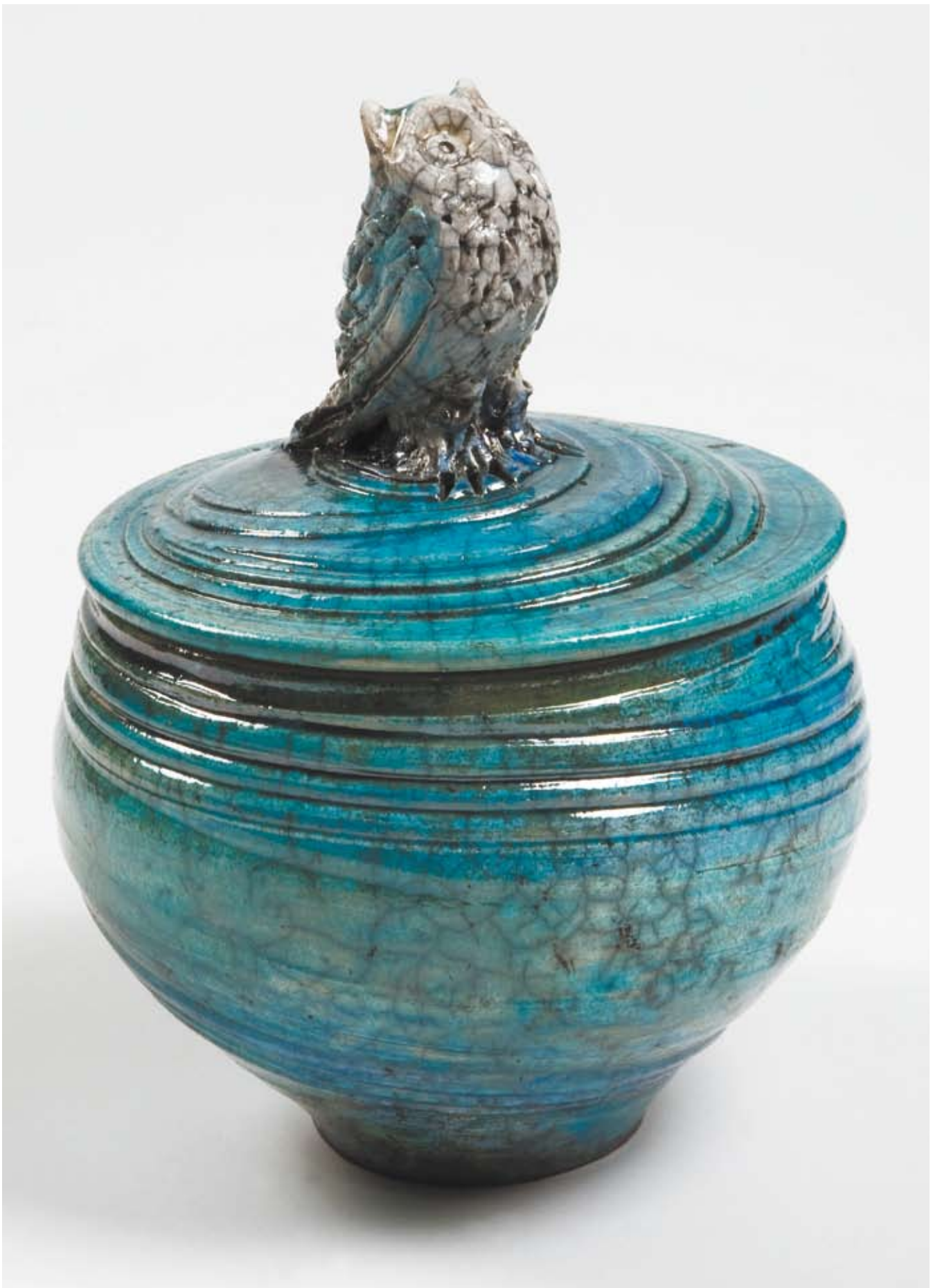
'Raku Owl Jar' by Oriain Pottery (Highly Commended - New Product Awards Showcase 2010).