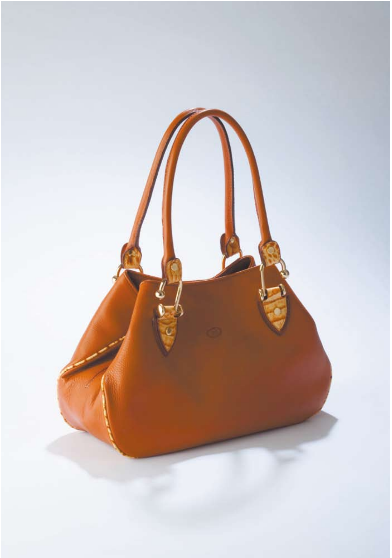
'Amber - Tan stablehide leather bag' by Inti Leathers of Louth Craftmark Designers Network - one of CCol's member organisations.