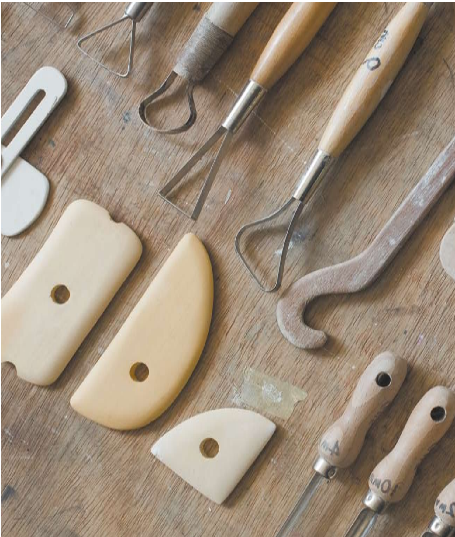
A selection of tools used at CCol's Ceramics Design and Skills Course, Thomastown, Co. Kilkenny.