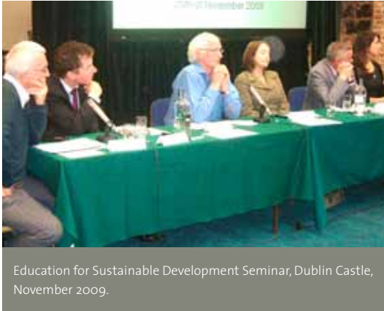
Education for Sustainable Development Seminar, Dublin Castle, November 2009.