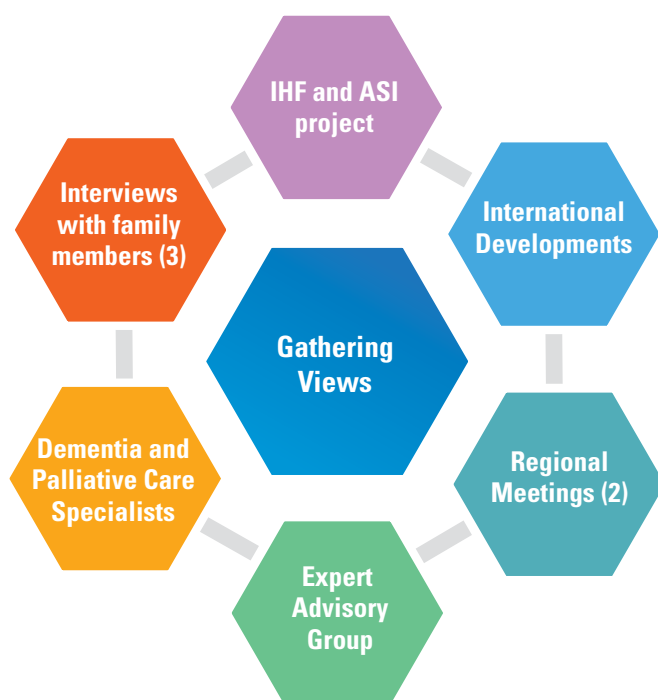
Diagram 1: Consultation methods used

The Feasibility Project adopted a collaborative and consultative approach and included consultations and dialogue with the advisory group, specialists, frontline service providers and users, including family members, across a range of services and sectors to scope out and identify pertinent issues for shaping the development of dementia palliative care. (See Diagram 1 and further details in Appendix 2) This study adopted an exploratory approach in order to signpost a specific work programme as outlined in the recommendations.